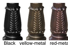
Black yellow-metal red-metal

Isolation degree Class I, IP Rating IP54