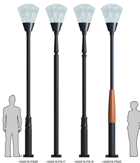
HA0016-PS06 HA0016-PS17 HA0016-PS18 HA0016-PS20

Application: Urban roads and street , Squares areas, Pedestrian areas, Residential areas,Parks Installing High: 3-5m Mounting : Post-top: suitable for Ø76mmx90mm tenon Lamps: HID (HPS MH)/ LED bulb / CFL lamps, 30W-150W 70W/150W HPS high pressure sodium, cap: E27/E26/E40/E39 70W/150W MH metal halide, cap: E27/E26/E40/E39 30W/40w/50W Led bulb, cap: E27/E26/E40/E39 35W/45W/65W Compact fluorescent, cap: E27/E26 Input Voltage: 90-270VAC,50-60HZ Material: FRP, fiber glass body Housing: Fiber glass reinforced plastics Globe : High efficiency acrylic refractor Color: Standard color are Black,Dark grey RAL7016 or Light grey RAL 7042 ,other colors are available Standards: Isolation degree Class I, IP Rating IP65